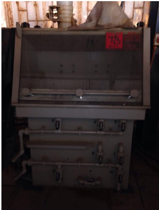
Type:Reducing Machine Machine: # 502