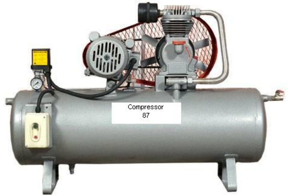
Type: Air Compressor Machine: # 87