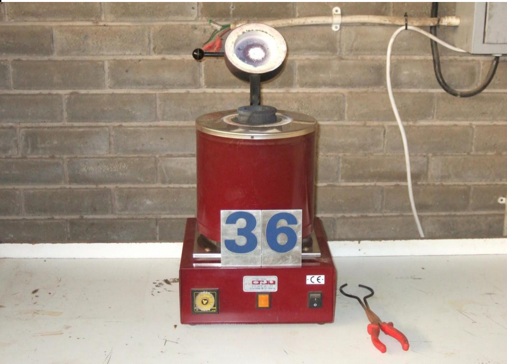
Type: Melting Furnace Company: Tenem - Israel Dimensions: W:270 H:400 L:270 Machine # 36