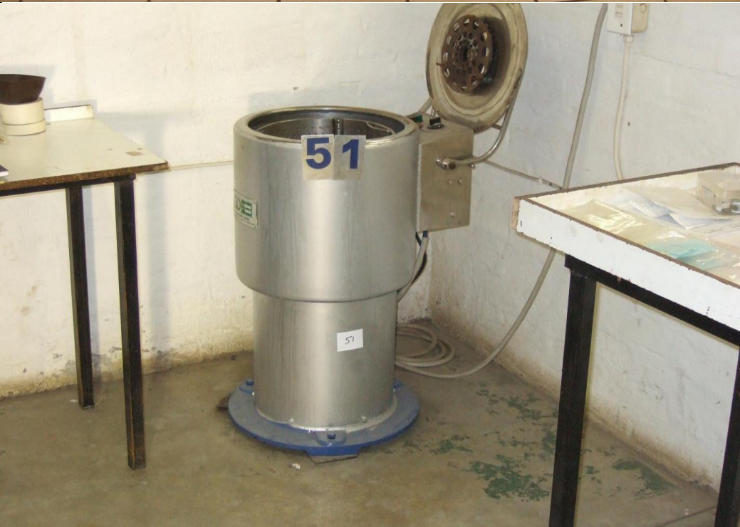
Type: Drier Centrifuge Machine 3 units Company: Italimpianti Orafi - Italy Model: 1E/A Machine # 51, 31, 64