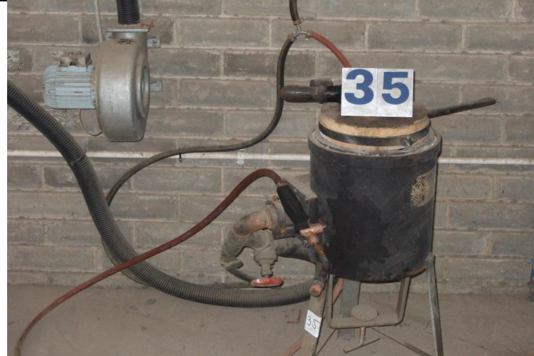
Type: Electrical Induction Melting Furnace Machine # 35